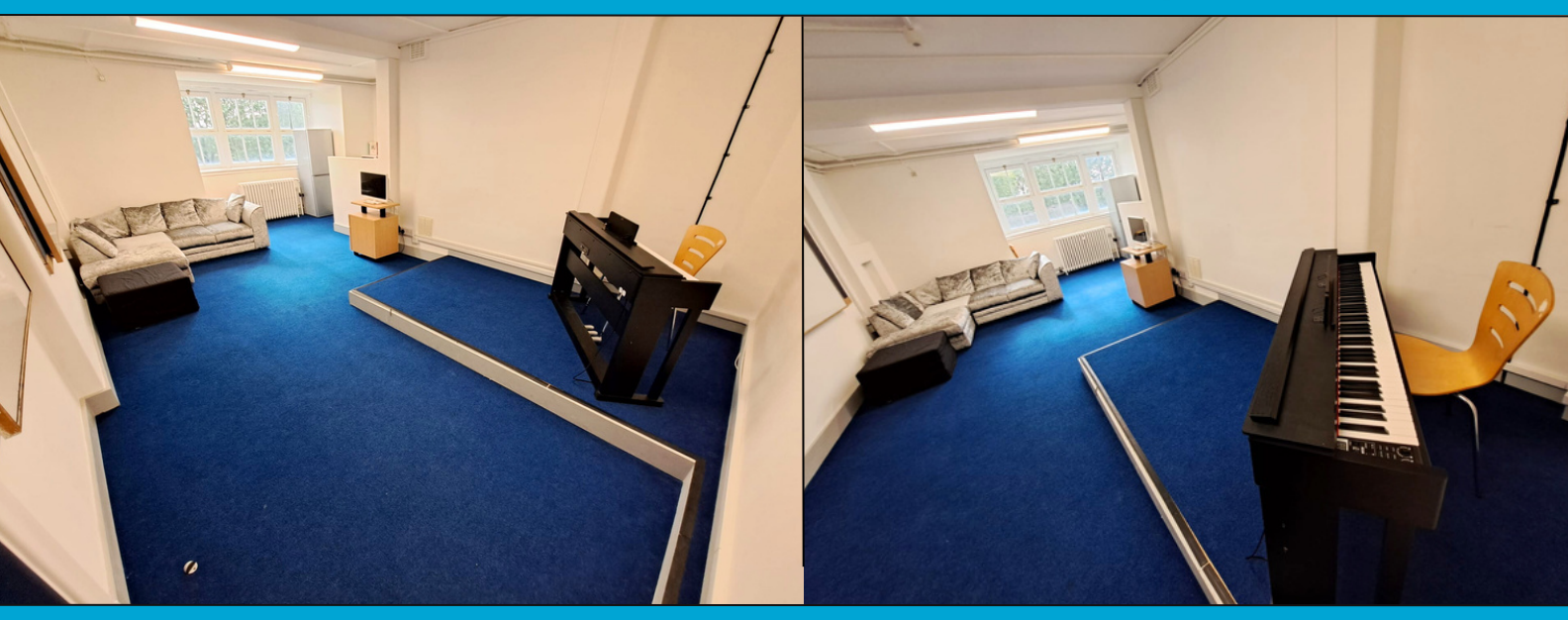
THE LOFT: Perfect for private singing/piano lessons and weekly meetings, £10-£15 per hour depending (piano included within hire)